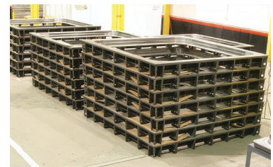
Besser adjustable pallet assemblies 4' x 2' through 8' x 8' for rubber gasket joints.