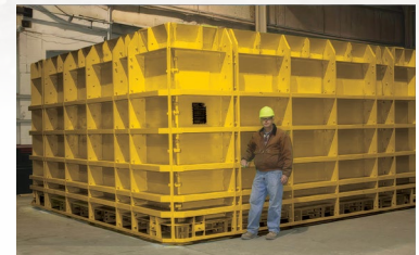
Besser manufactures several variations of adjustable box culvert mold equipment. The wet cast mold construction shown here is similar to static cast or egg lay mold construction.