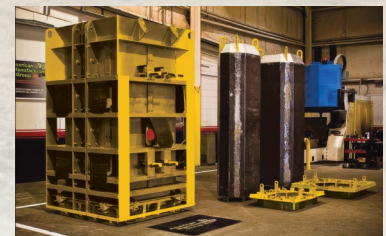
A typical example of a rise adjustable form and solid cores for dry cast egg laying.